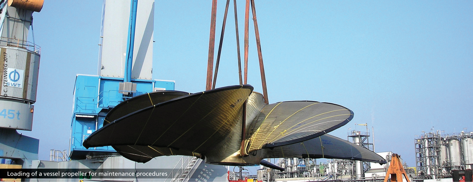
Loading of a vessel propeller for maintenance procedures