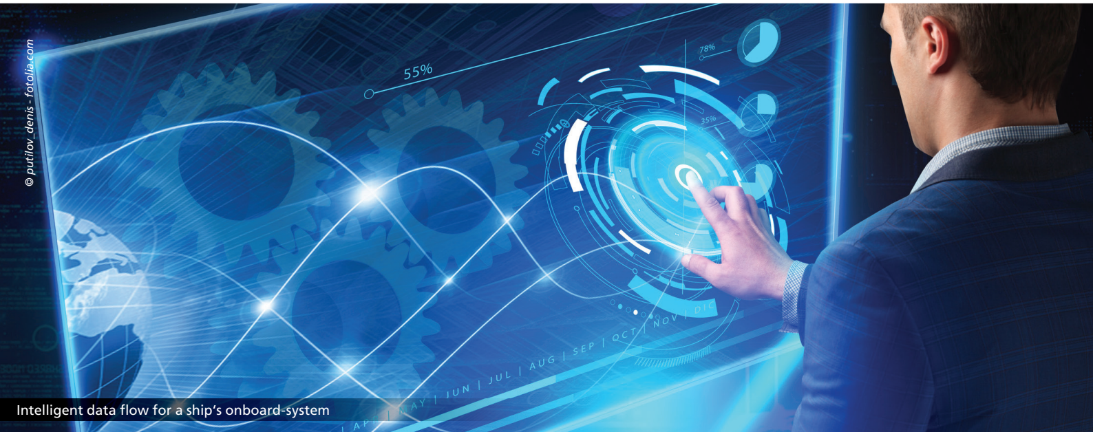
Intelligent data flow for a ship's onboard-system